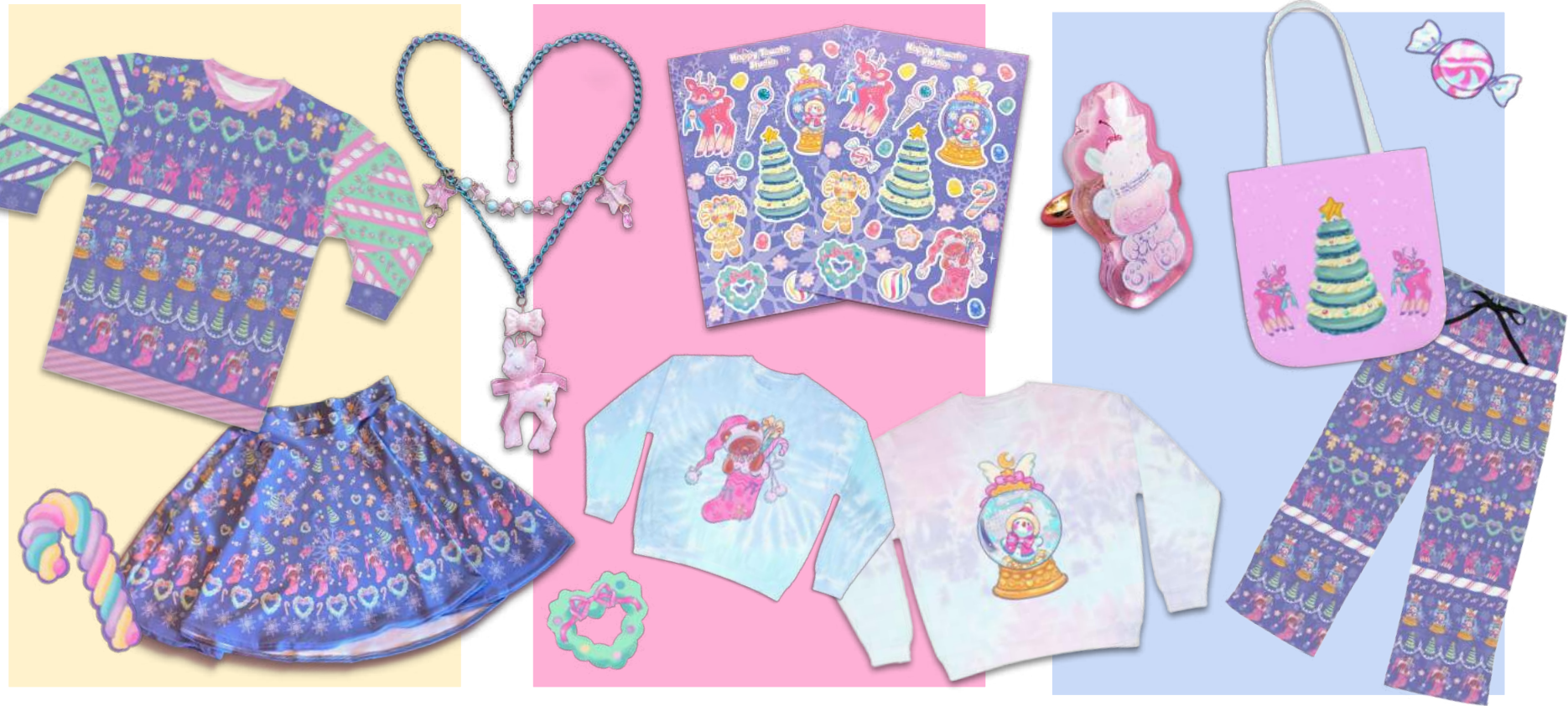
Holiday Merchandise Collection