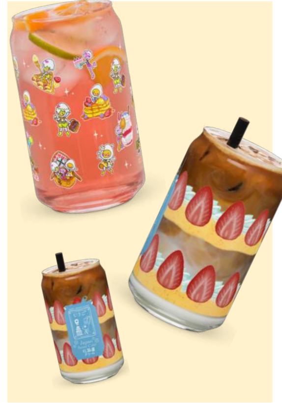
Merchandise Surface Design